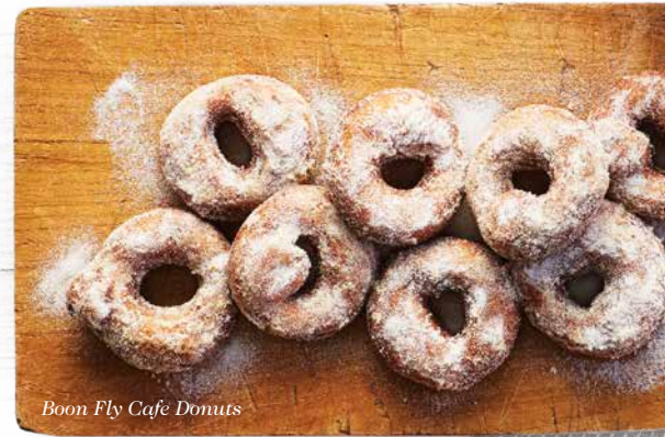
Boon Fly Cafe Donuts

This charming café is located in the heart of Carneros in Napa adjacent to the Carneros Resort. This contemporary roadhouse serves modern rustic cuisine with dishes like their Akaushi Kobe Beef Burger or their famous Baby Back Ribs. Don't miss their Boon Fly Café donuts with the chocolate dipping sauce any time of the day. Weekend Brunch is a must try with the Boon Fly Benedict or the Breakfast Tacos. Dinner is the best time to avoid the crowds, but you can also make a reservation.