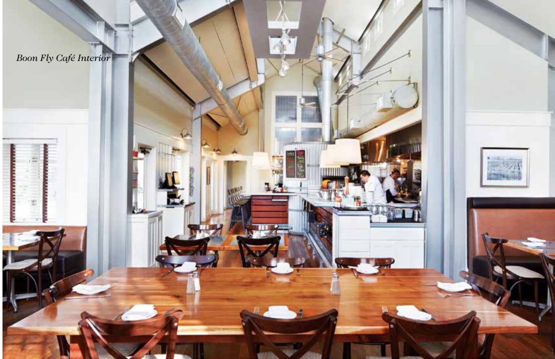
Boon Fly Café Interior

offers an extensive plethora of incredible dining options a little more off the radar. With Napa Valley's culinary centric growth, adding to the many popular local's favorite haunts are new and innovative bistros, cafes, brewpubs and trattorias popping up throughout the Napa Valley. Always a delicious day in our Wine Country! Here are a few selections to give a tasty try!